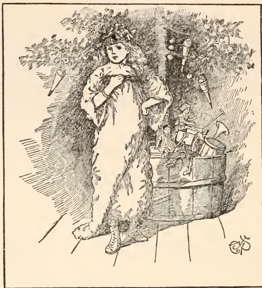
A CHRISTMAS DREAM.